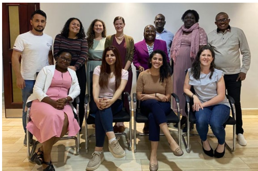
FIGURE 1 WfWI and GWI Project Managers and researchers during the project's kick-off meeting in Kigali, Rwanda 2022